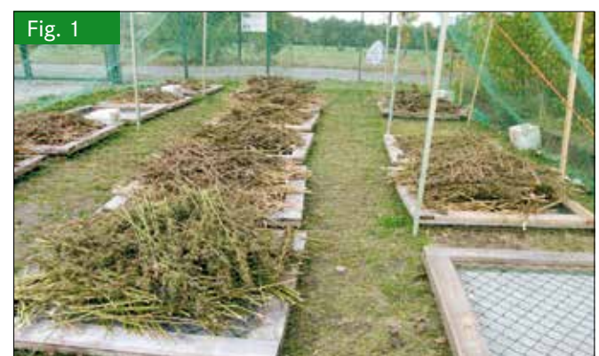
Fig. 1 Experimental swaths under a bird protection net

The areas used for experimentally growing different varieties of hemp are situated in the immediate vicinity of the Leibniz Institute for Agricultural Engineering Potsdam-Bornim (52°26'14"N, 13°0'58"E). There are two plots with 0.31 ha each. On plot 9, the French hemp variety Santhica-27 was sown, on plot 10 the French variety Fedora-17. According to the speci-