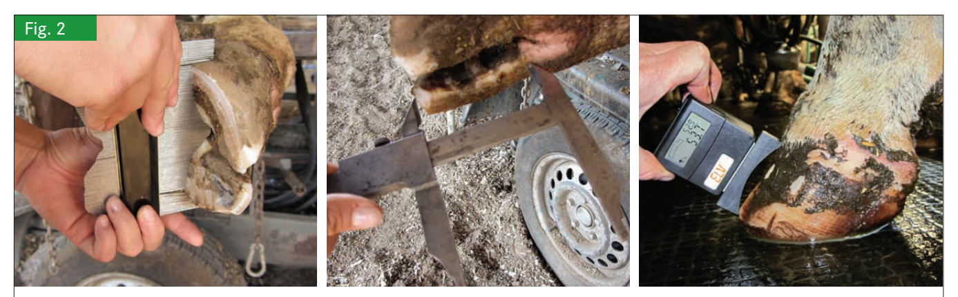
a) Measurement of the sole profile