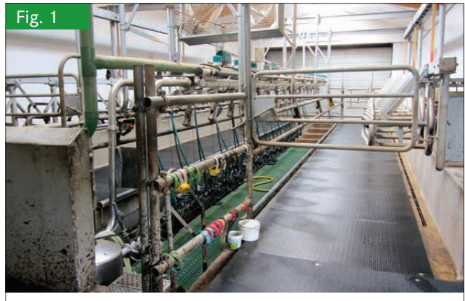
Fig. 1: Elastic flooring in the herringbone parlour with fast exit

At the end of April 2013 the parlour floor was fitted with elastic rubber matting ( Figure 1 ). The rubber mats (KURA Form, Gummiwerk Kraiburg Elastik GmbH & Co KG) were 24 mm thick, with 5 mm high studs on the underside and, when dry, returned a sliding friction coefficient of \mu = 0.61.