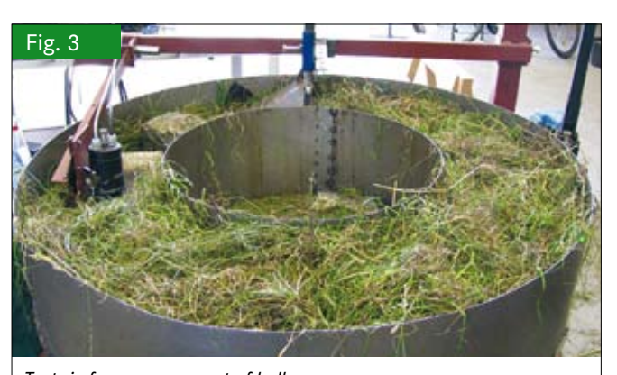
Test rig for measurement of bulk crop