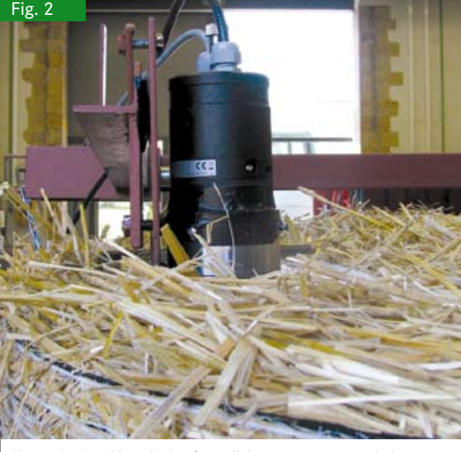
Measuring head installation for radial measurements on bales